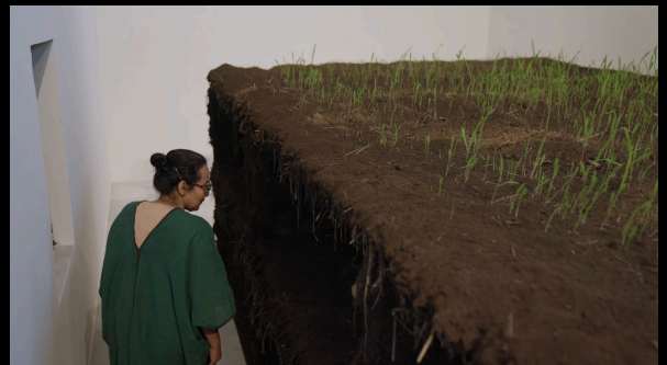
Production still from the Art in the Twenty-First Century Season 12 episode, "Human Nature." © Art21, Inc. 2026; Production still from the Art in the Twenty-First Century Season 12 episode, "Human Nature." © Art21, Inc. 2026; Production still from the Art in the Twenty-First Century Season 12 episode, "Human Nature." © Art21, Inc. 2026; Production still from the Art in the Twenty-First Century Season 12 episode, "Human Nature." © Art21, Inc. 2026.