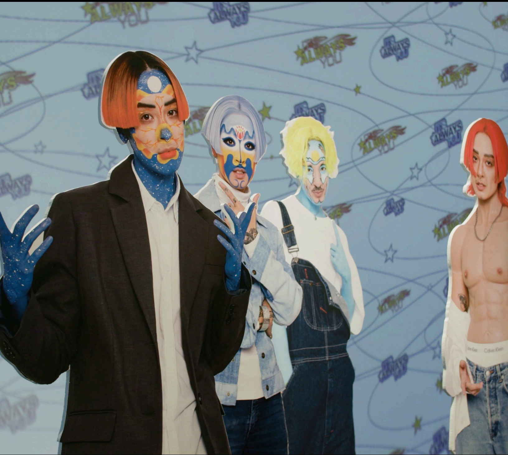
Production still from the Art in the Twenty-First Century Season 12 episode, "Human Nature."