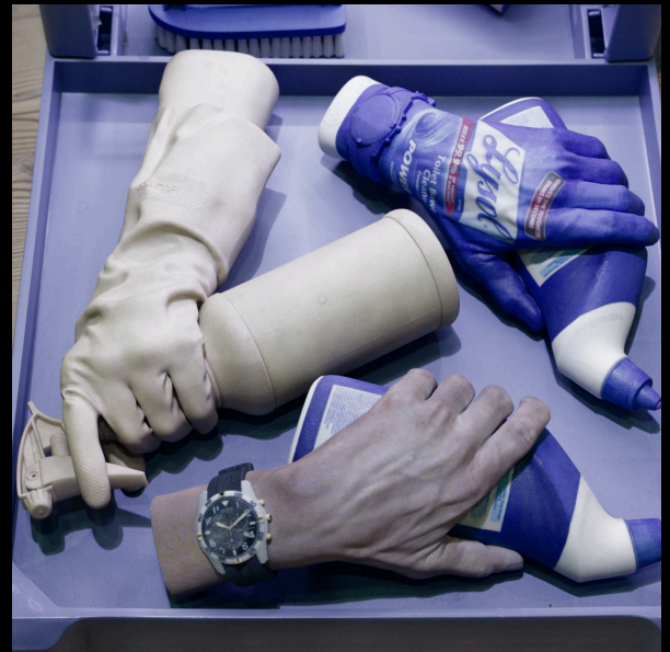
Production still from the Art in the Twenty-First Century Season 12 episode, "Human Nature." © Art21, Inc. 2026; Production still from the Art in the Twenty-First Century Season 12 episode, "Human Nature." © Art21, Inc. 2026; Production still from the Art in the Twenty-First Century Season 12 episode, "Human Nature." © Art21, Inc. 2026; Production still from the Art in the Twenty-First Century Season 12 episode, "Human Nature." © Art21, Inc. 2026.