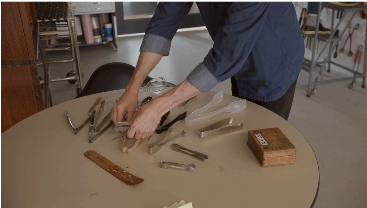
Production still from the Art in the Twenty-First Century Season 12 episode, “Human Nature.”