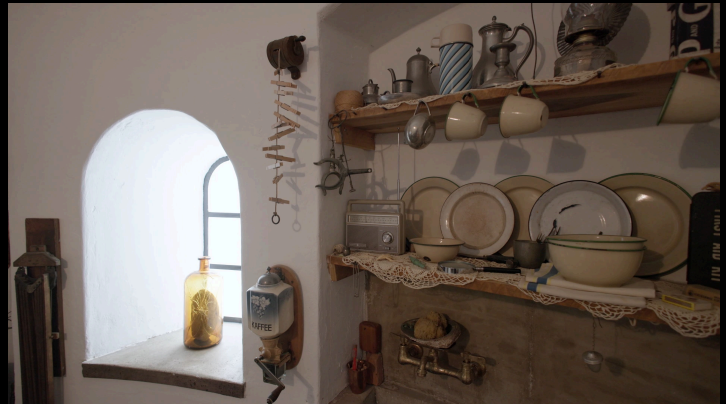
Lenka Clayton in her studio. Production still from the Art in the Twenty-First Century Season 12 episode, "Human Nature." © Art21, Inc. 2026.; Production still from the Art in the Twenty-First Century Season 12 episode, "Human Nature." © Art21, Inc. 2026.; Production still from the Art in the Twenty-First Century Season 12 episode, "Human Nature." © Art21, Inc. 2026.; Production still from the Art in the Twenty-First Century Season 12 episode, "Human Nature." © Art21, Inc. 2026.