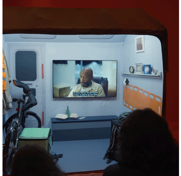
Production still from the Art in the Twenty-First Century Season 12 episode, "Human Nature."