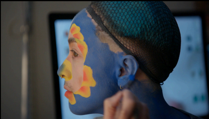
Production still from the Art in the Twenty-First Century Season 12 episode, "Human Nature." © Art21, Inc. 2026; Production still from the Art in the Twenty-First Century Season 12 episode, "Human Nature." © Art21, Inc. 2026; Production still from the Art in the Twenty-First Century Season 12 episode, "Human Nature." © Art21, Inc. 2026; Production still from the Art in the Twenty-First Century Season 12 episode, "Human Nature." © Art21, Inc. 2026.